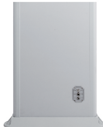
◀ Power supply and linkage interface