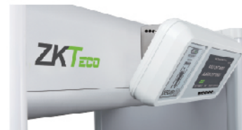
◀ Metal bracket